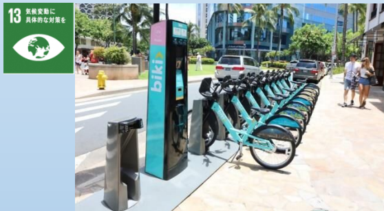
(Hawaii: Bicycle-sharing service)