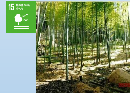
(Shizuoka City: Overgrown bamboo groves causing other trees and plants to die)