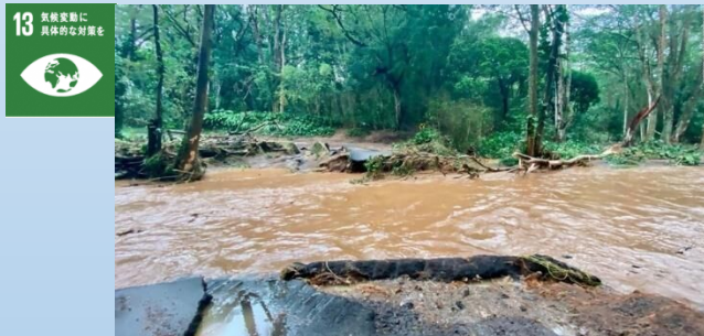
(Hawaii: Heavy rain due to climate change)