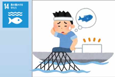
(Shizuoka City: Poor tuna catches due to the depletion of marine resources)