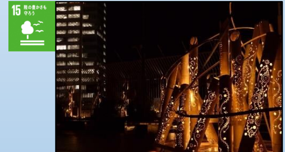
(Shizuoka City: Lantern displays using bamboo from overgrown bamboo groves)

Introduce an SDGs initiative that you've seen in your area (and that you could take part in), or an initiative being taken by local students your age.